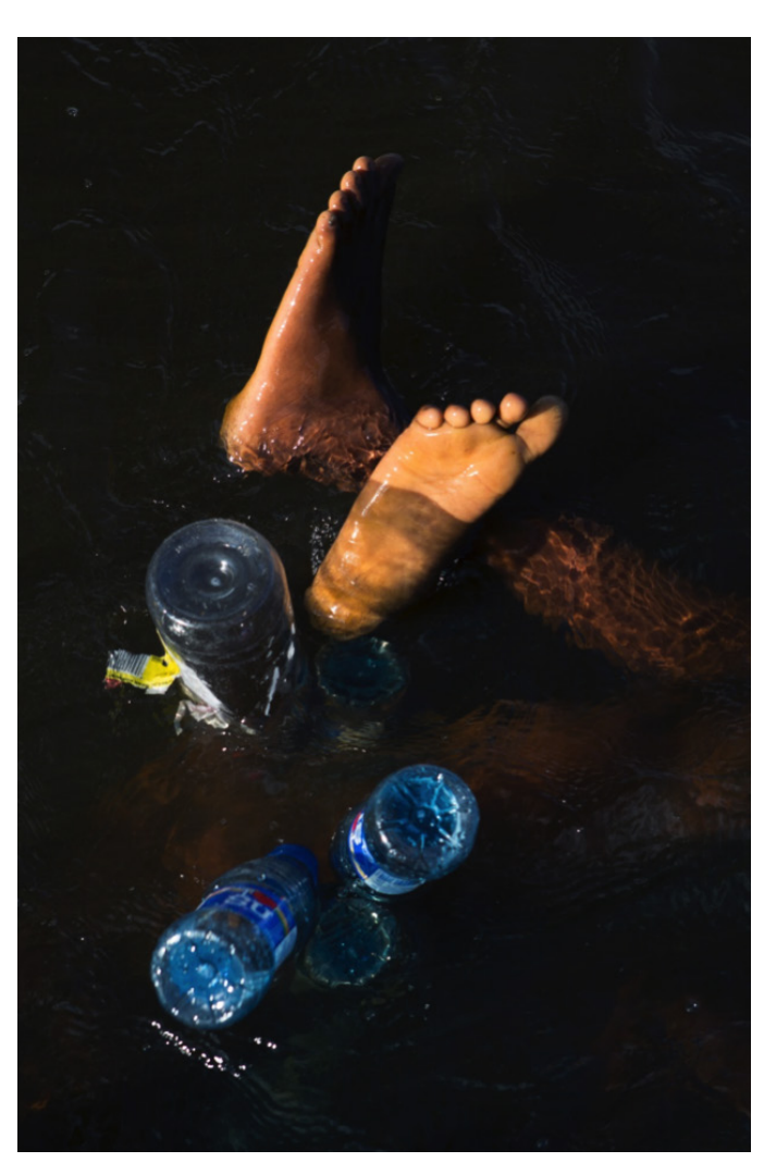
Do¦éki, C-Print Photograph © Viviane Sassen Courtesy the artist and Stevenson Galler

The ICA is delighted to present a solo exhibition of recent work by Viviane Sassen, a photographer who has garnered parallel critical acclaim as a fashion photographer and in the context of contemporary visual art. The content of the exhibition focuses predominantly on a body of work that Sassen made in Pikin Slee, Suriname in 2013. Pikin Slee is the second-largest village on the Upper Suriname River, deep within the Surinamese rainforest. The exhibition consists of black and white and colour works shot digitally.