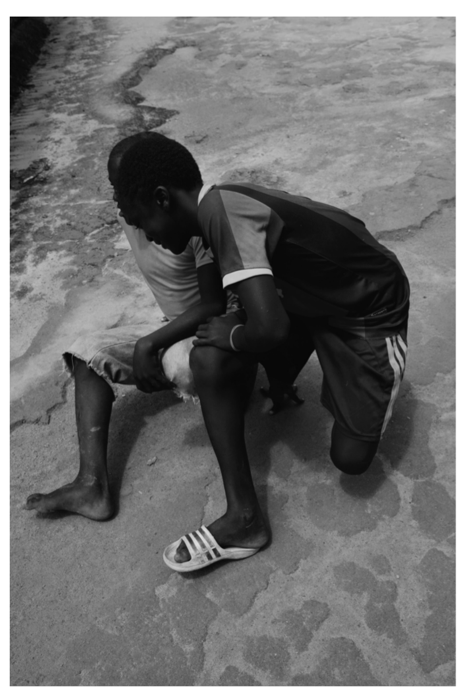
Latum, 2013. C-Print Photograph © Viviane Sassen Courtesy the artist and Stevenson Gallery