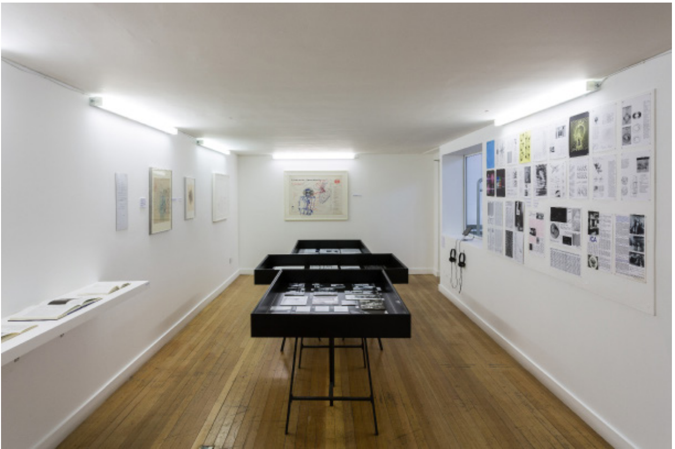
Installation view of Cybernetic Serendipity 14 Oct – 30 Nov 2014 Institute of Contemporary Arts London (ICA)